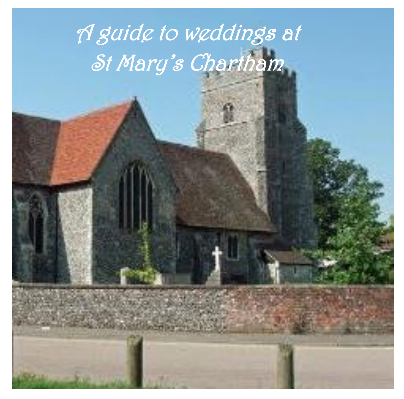
An all you need to know guide (we think) to getting married at St Mary's Church in Chartham.